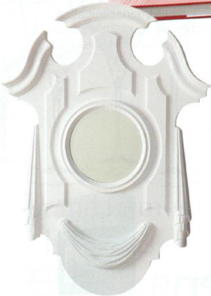
MIRROR Kindel Furniture Dorothy Draper Collection American Baroque $4,485 1212decor.com.