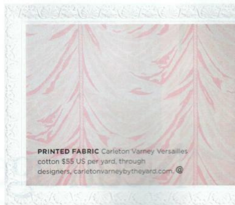
PRINTED FABRIC Carleton Varney Versailles cotton $55 US per yard, through designers, carletonvarneybytheyard.com. ©