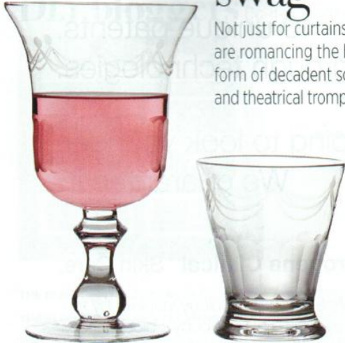
GLASSWARE Feathery Fronds goblet $14, tumbler $11 indabatrading.com.

Not just for curtains, richly draped swags are romancing the home in the form of decadent sculptural detail and theatrical trompe l'oeil prints.