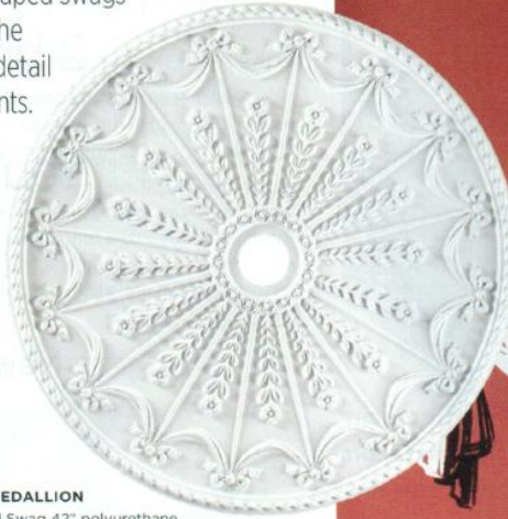
CEILING MEDALLION Ribbon and Swag 42" polyurethane $274 elitetrimworks.com.