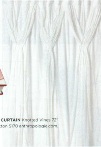
SHOWER CURTAIN Knotted Vines 72" square cotton $178 anthropologie.com.